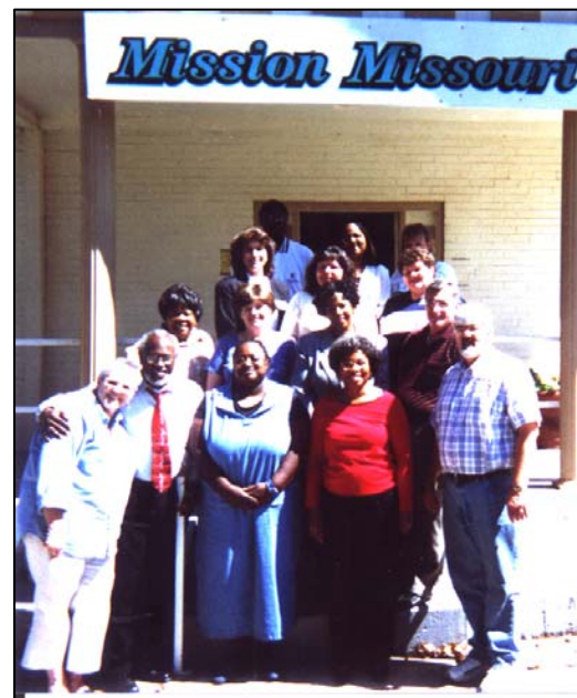
Committed Caring Faith Communities is one of eight partners of Mission Missouri's Crossing Addiction Freedom Program. The program received a $1.5 million grant from the Missouri Foundation for Health to provide pre-treatment, aftercare, education and outreach in a nine-county area in Southeast Missouri.